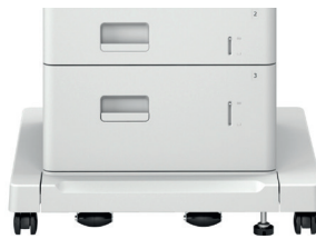
High Capacity Cassette Feeding Unit-D1