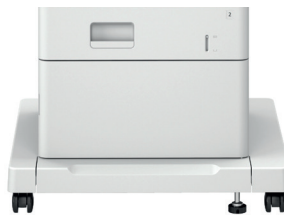
Cassette Feeding Unit-AR1